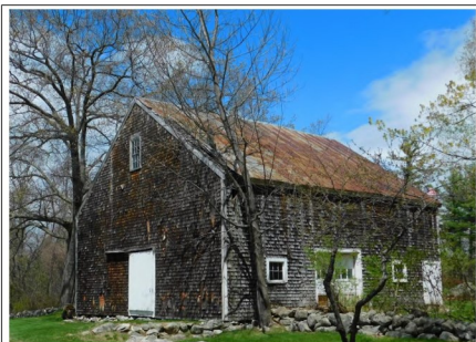
The Barn – Gifted to the Town 2018 – Dismantled Spring 2018

This barn will provide space for holding educational events, private, public and civic events and activities. It will provide an opportunity for rental purposes, for events such as, weddings, demonstrations, lectures, and funding events. The revenue from rentals would support the Farmstead and its activities. Additional uses could include community meetings, a place holding local elections, youth, and scouting programs and so on. Future space needs for the community could be met with the barn.