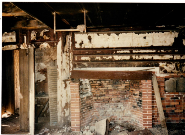
Photograph on the left is the parlor, on the right the East room fire place and bee-hive oven..